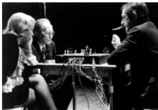
A scene of Duchamp, Teeny, and Cage playing